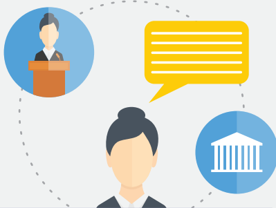
JUSTICE RUTH BADER GINSBURG

Some people think fair use is a minor exception or a marginal carve-out from the expansive protection for authors, but fair use is a fundamental right .